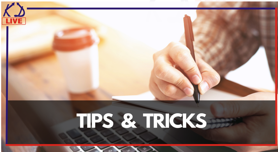
Image Series Questions Tips and Tricks