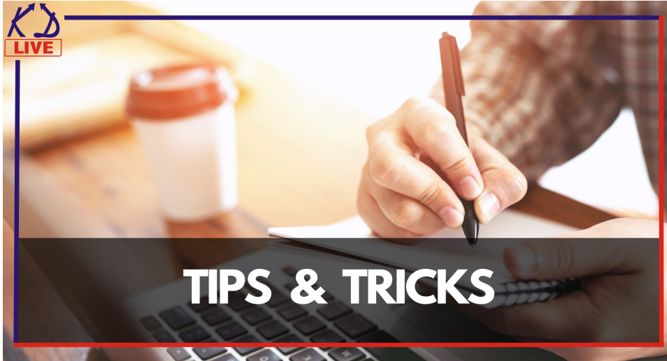
Image Series Questions Tips and Tricks