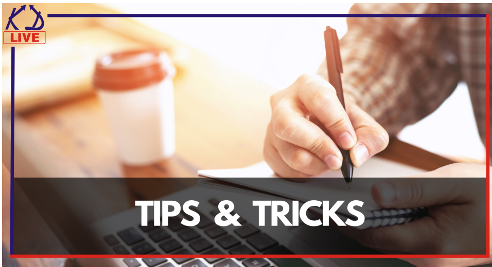
Image Series Questions Tips and Tricks