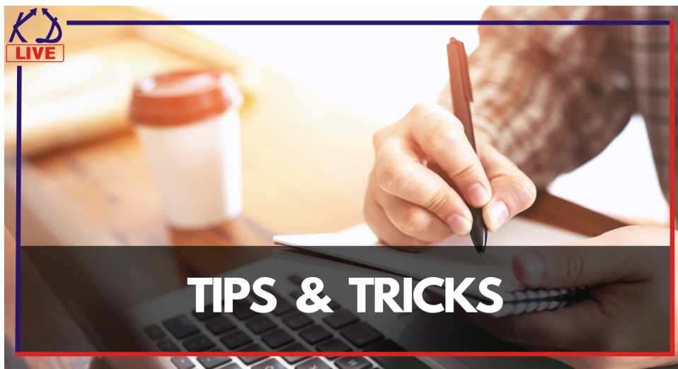
Image Series Questions Tips and Tricks