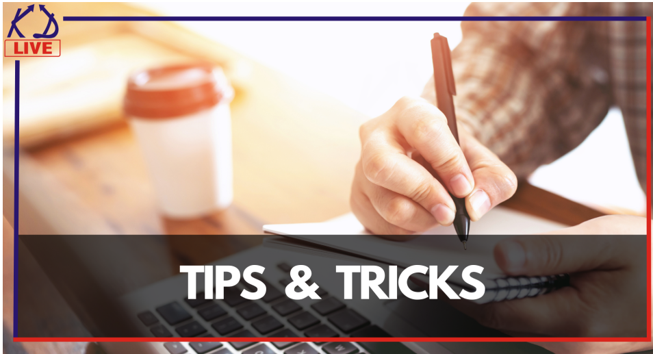
Image Series Questions Tips and Tricks