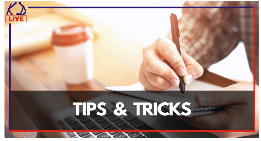
Figure Based Questions Tips and Tricks