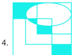
Figure Based Questions Solution