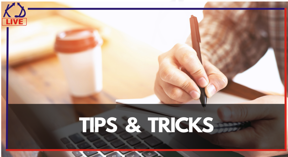
Figure Based Questions Tips and Tricks