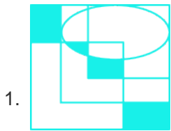
Figure Based Questions Options