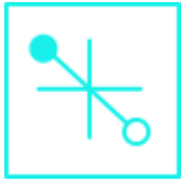
Figure Based Questions Solution