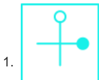
Figure Based Questions Options