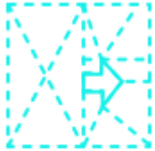
Figure Based Questions Tips and Tricks

The given figure is embedded in option 2, as shown below: