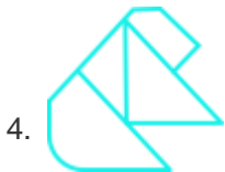
Figure Based Questions Solution