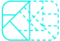
Figure Based Questions Tips and Tricks

The figure in option 1 is embedded in the given figure, as shown below: