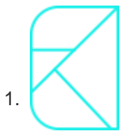
Figure Based Questions Options