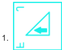
Figure Based Questions Options