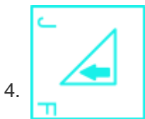
Figure Based Questions Solution