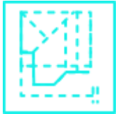
Figure Based Questions Tips and Tricks

The given figure is embedded in option 2, as shown below: