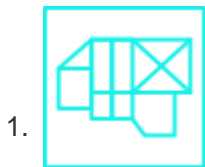
Figure Based Questions Options