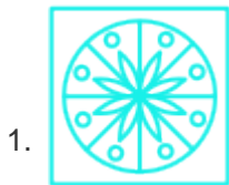
Figure Based Questions Options