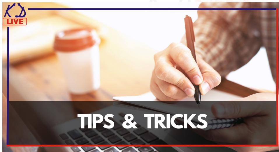
Figure Based Questions Tips and Tricks

triangles: ABI, AIH, HIG, BCI, CIF, GIF, HIF, AIC, ACH, CFH, AHF, ACF, CJF, CJD, DJE, JFE, DFE, CDF, ADF, CHE, CDF, FDE, GKF, GKM, LKM, LKF, GFL, GML, GFM, FLM, BDM, IFM.