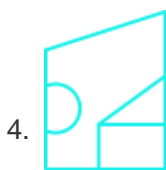
Figure Based Questions Solution