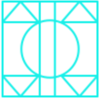
Figure Based Questions Tips and Tricks

The pieces given in the question figure helps in forming the following figure.