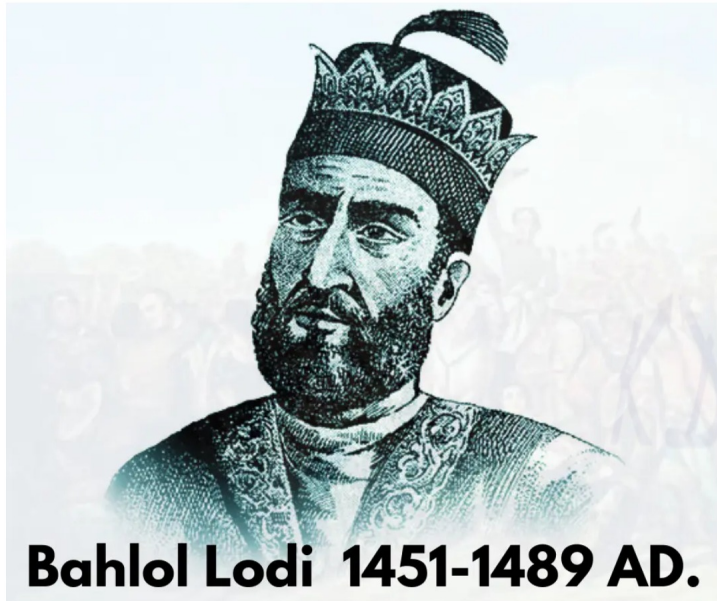
Bahlul Lodi 1451-1489 AD.

1) Today in 1489 Bahlul Khan, founder of the Lodi Dynasty, died.