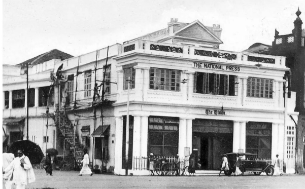
100 Mount Road, the home of The Hindu from 1883 to 1939.

Let's find out what happened in 20th September in History