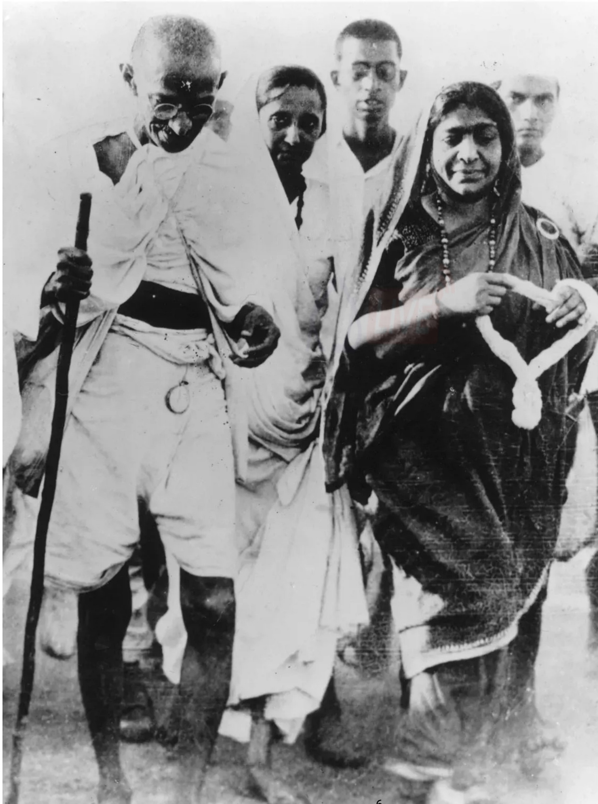
Sarojini Naidu - The Nightingale of India

10000+ HOURS OF VIDEOS All videos are well-explained for you to get every bit out of the videos