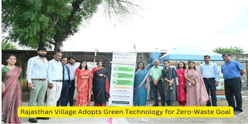
Rajasthan Village Adopts Green Technology for Zero-Waste Goal