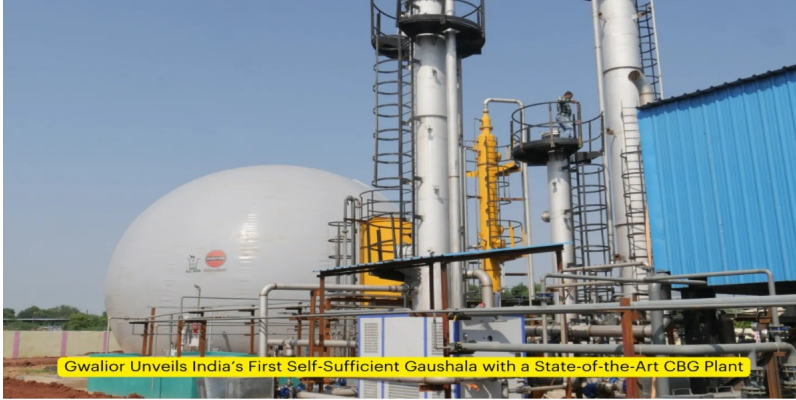
Gwalior Unveils India's First Self-Sufficient Gaushala with a State-of-the-Art CBG Plant