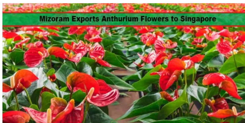
Mizoram Exports Anthurium Flowers to Singapore

The Agricultural and Processed Food Products Export Development Authority (APEDA), in collaboration with the Mizoram Horticulture Department, facilitated the first-ever export of Anthurium flowers from Mizoram to Singapore. The consignment, comprising 1,024 flowers, was exported via Kolkata by IVC Agrovat Pvt. Ltd. and imported by Veg Pro Singapore Pte. Ltd. This milestone boosts floriculture exports from India's North Eastern Region. The initiative follows APEDA's International Buyer-Seller Meet, highlighting Mizoram's floriculture potential and economic benefits for local farmers, especially women.